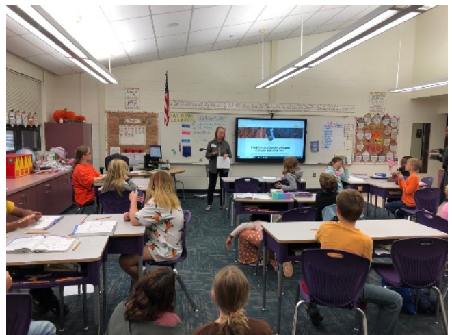
Veterans' Essay Contest kick-off Chaires Elementary, 4th graders