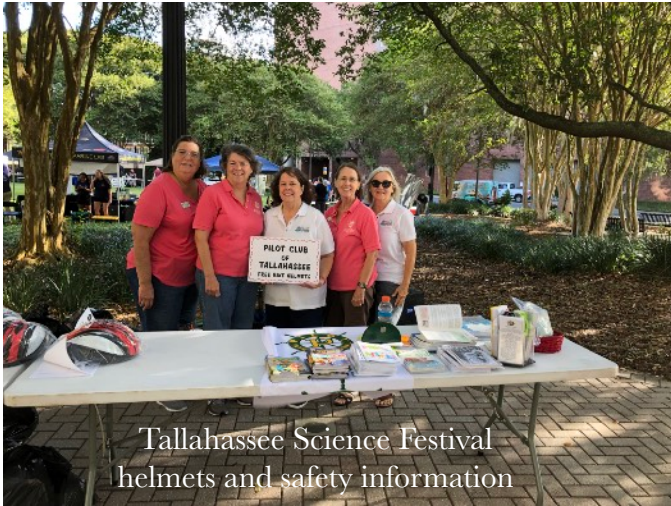
Tallahassee Science Festival helmets and safety information