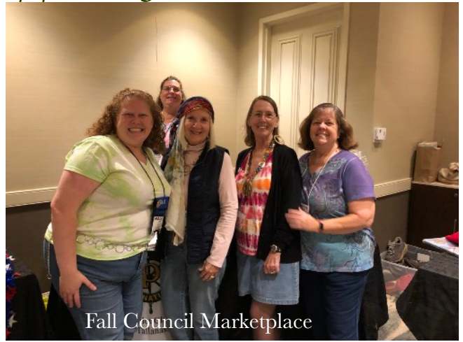
Fall Council Marketplace