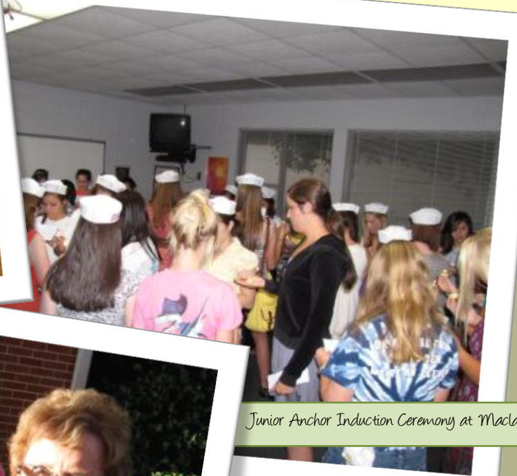
Junior Anchor Induction Ceremony at Maclay