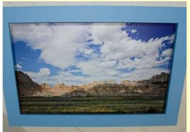
Room Ceiling art in the examination room